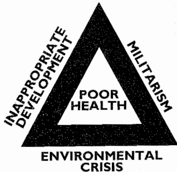
Figure 1. Overwhelming debt accumulated by nations of the South has three interwoven sources: development policies inappropriate to local economies, vast expenditures on weapons, and ecological destruction. The devastating effect on health and well being, with consequences for both the North and the South, is undermining global security.

The debt assumed the importance it now has, however, with the money generated from the oil profits of the mid 1970s, which many private banks in the North lent to the South at low interest rates. At the start both parties to the transaction were interested in enabling the poor South to travel the same development path forged by the rich North. This path was one of industrialisation through projects highly dependent on capital, skilled labor, and non-renewable resources, usually without regard to environmental impact. Stark testaments to this process are the sprawling coal and iron complexes, nuclear power stations, and traffic-choked cities in Northern industrial countries.