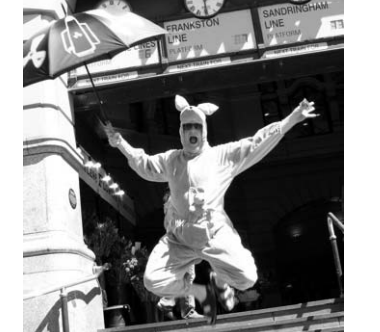
As the ICAN-garoo "hopping mad for nukes", he acknowledged that "the velcro on this roo suit offers more security than nuclear weapons".

mate preventable health catastrophe and dedicated decades of his life to the prevention of war and the abolition of nuclear weapons."