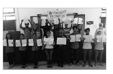
Throughout India "Don't shed blood, donate blood"

IPPNW featured armed violence prevention at the Safety 2016 conference co-hosted by the WHO.