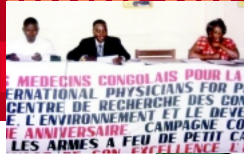
Affiliates in Action: working for peace through health