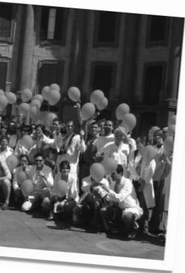
LEFT: IPPNW MEDICAL STUDENTS PARTICIPATING IN A TARGET X INSTALLATION AT THE EUROPEAN MEDICAL STUDENT REGIONAL MEETING IN NAPOLI, ITALY.

Building up to the 17th IPPNW World Congress, thirty medical students biked